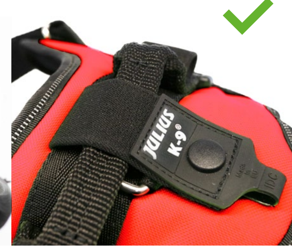
manufactured since 2021: